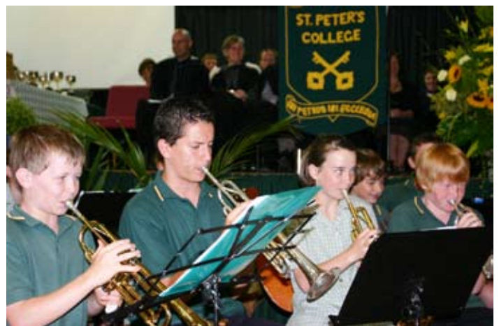
The Junior Band entertaining the audience at Junior Prizegiving

Due to health and safety requirements, a large number of parents accompanied each class. Thank you to all the parents and young adults who supported us in this very valuable programme.