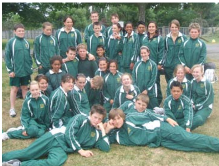
The Supersports Athletics Team