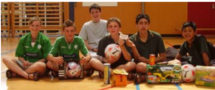
Prizewinners in the 'World Cup' Tournament held recently