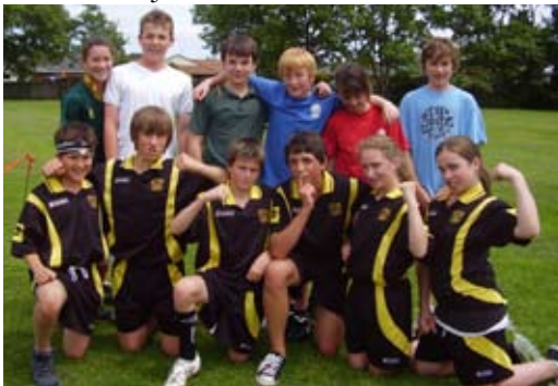
Year 7 and 8 teams (NZ/USA) in the 'World Cup' Tournament