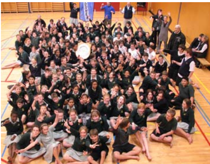
O'Shea House - winners of the House Competition which was announced at the Final Full School Assembly recently