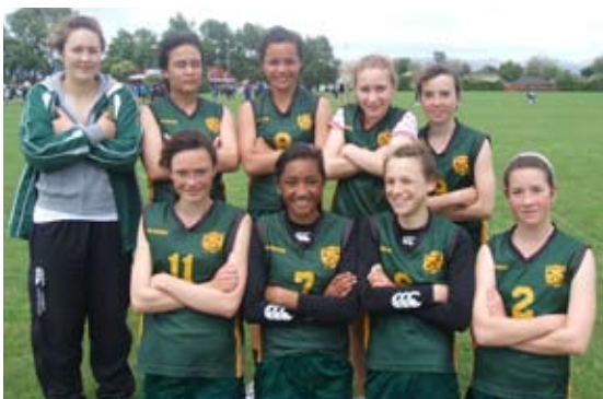
Supersport Touch Team