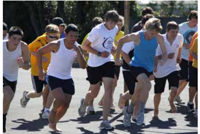
And they're off! Enthusiastic participants in the Road Race!

The Warehouse Stationery Support Your School programme will be on again from 16th April and will run all year. Parents can purchase items of stationery online at www.warehousestationery.co.nz by entering the school's unique code BYS84YM in the Promo Code box at the online checkout. You can print our school's voucher and present it at the Warehouse Stationery checkout or online. BlueBiz points will be awarded to our school, helping us to get more resources. Thank you for your support!