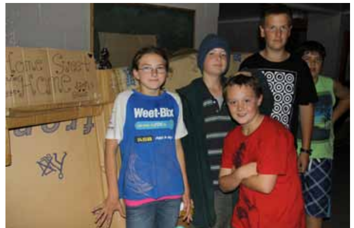
'Slummers' putting together their cardboard homes